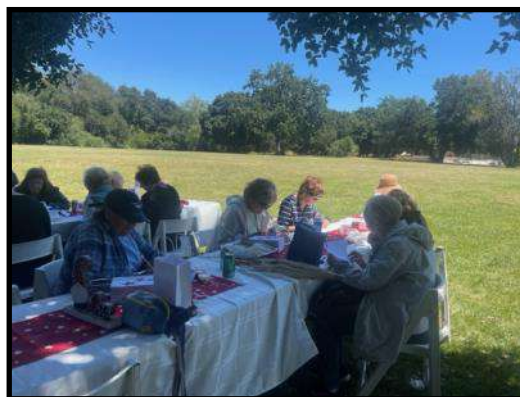
Playing afternoon games!